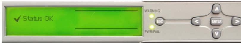
Harmonic ProView 7100

In order for Royal Navy and Royal Fleet Auxiliary Ships to receive the SKY Movies Channel the following procedure should be followed. This can be done from the front panel of the IRD, you will have either a ProView 7100 or an older 7000 model. The system must be locked to the satellite to do this.