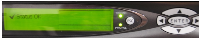
Harmonic ProView 7000

The following procedure is for the Eutelsat 10A satellite